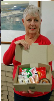
Di holding a sample package

The following is a mix of responses received from a number of appreciative recipients .